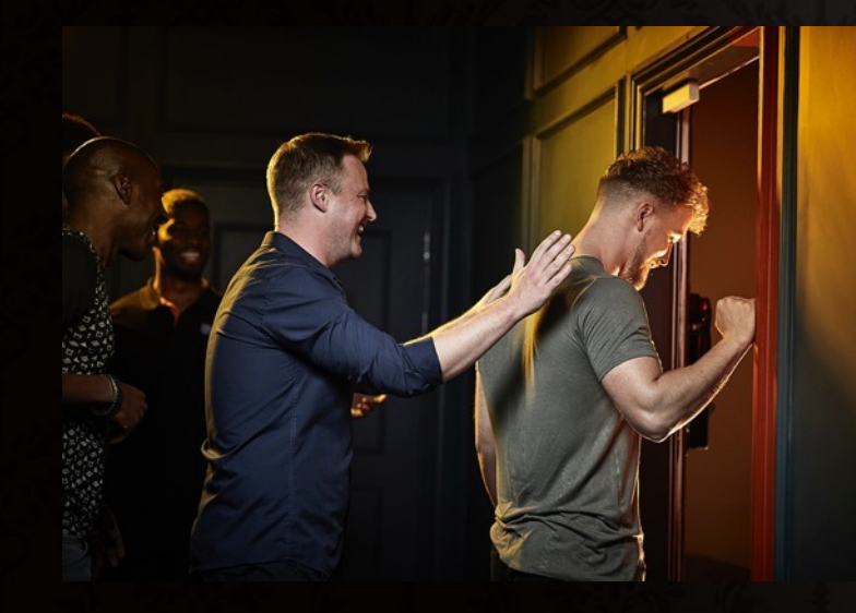
Assemble your best team of Escape Hunters. It's just you, four walls, the ceiling and the floor. The lock clicks, the clock ticks, time is of the essence.